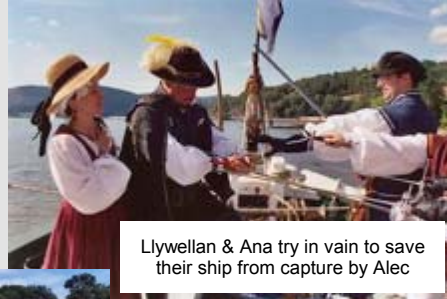
Llywellan & Ana try in vain to save their ship from capture by Alec